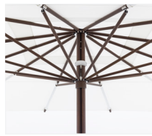
2" Reinforced Ribs