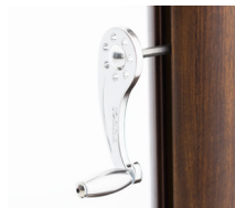
Telescoping Mast with EasyDrive Crank Lift System