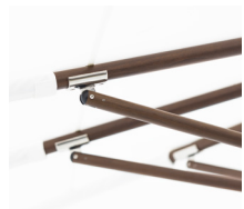
Reinforced Strut Joint Connector