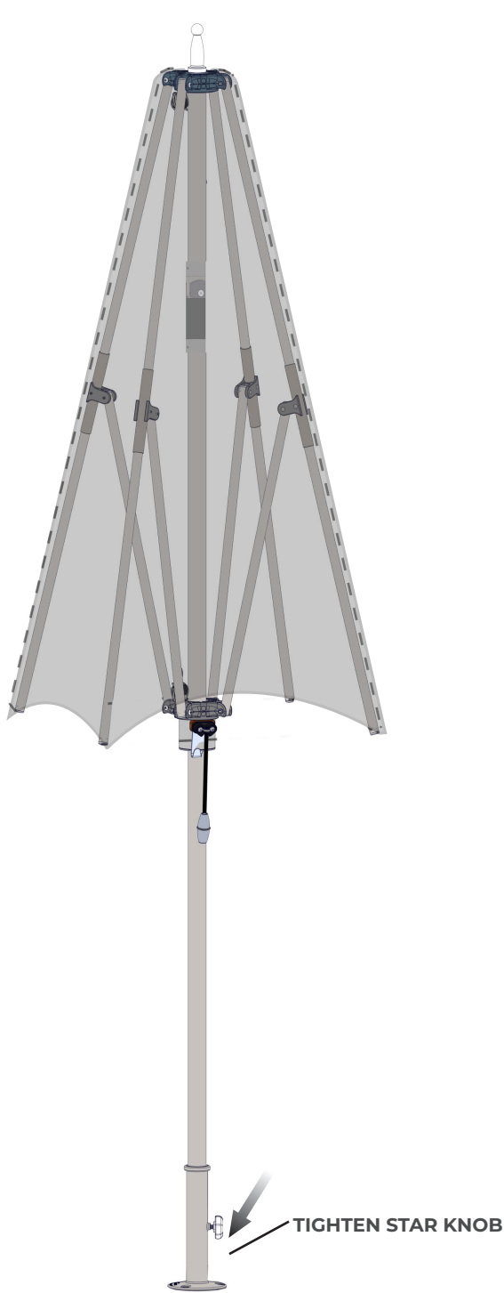
WITH ABOVE GROUND ANCHOR

INSERT AND SECURE PARASOL INTO APPROPRIATE ANCHOR.