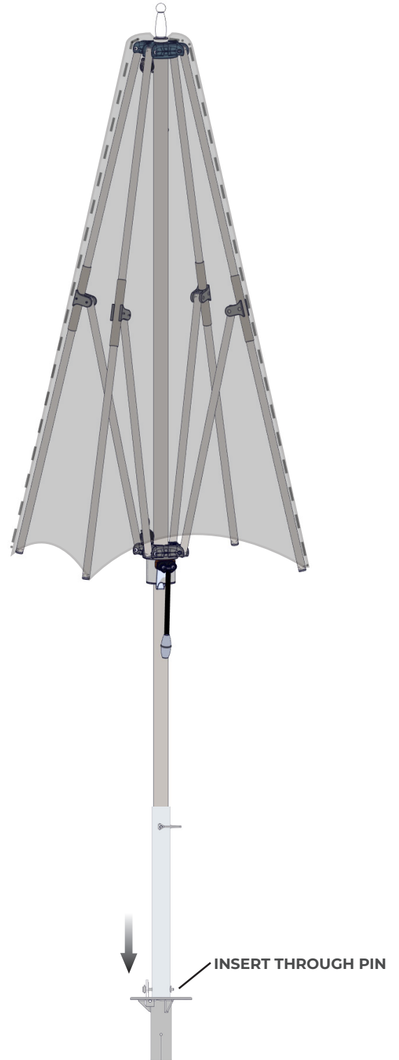
WITH IN-GROUND FLUSH MOUNT